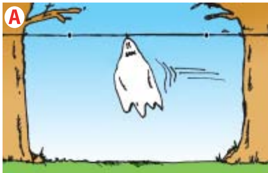
A Keep cable as tight and horizontal as possible.